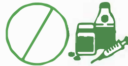
Drug, Alcohol & Addiction Recovery