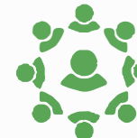
Other Community Services