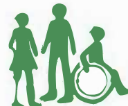
Office for People with Developmental Disabilities